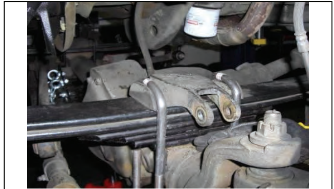
Replace spring plate with new longer U-bolts