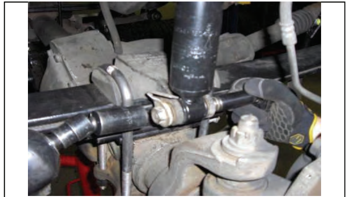
Reinstall lower shock into original position with OE hardware