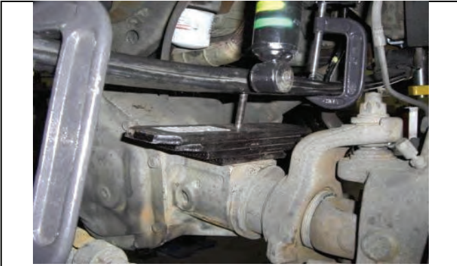
Remove nut from new center bolt and place into position