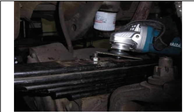
Cut-off excess threads to allow proper fitment of spring plate