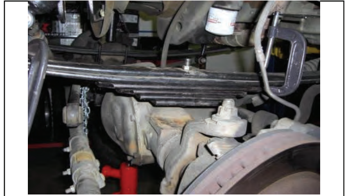
Tighten new leaf stack to OE leaves with provided nut