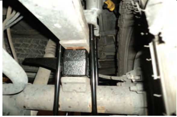
Raise axle and secure block with new u-bolts and hardware.

Make sure block pins are aligned properly in axle and leaf pack. Align u-bolts and tighten, perform the following steps on the opposite side. Lower vehicle to ground and torque u-bolts to factory specs. Double check all work and test drive vehicle. Have your vehicle aligned and enjoy.