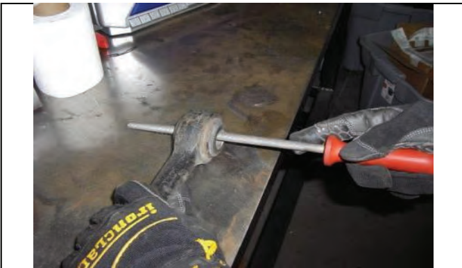
On both ends of the trac bar use a file to smooth inner sleeve