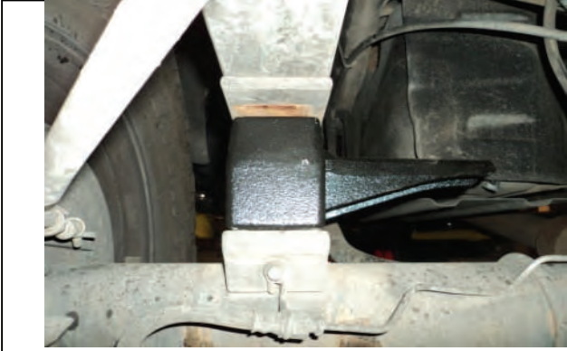
Remove OE axle block and replace w/ new lift block.