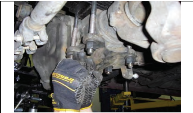
Attach lower spring plate with new hardware and tighten