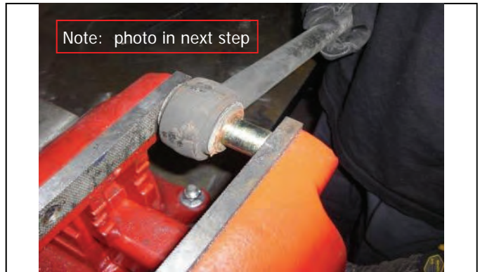
Then press new offset sleeve as shown. DO NOT HAMMER!