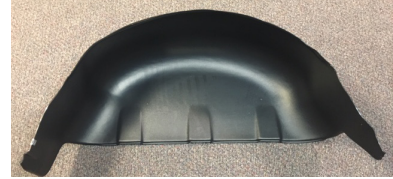
Wheel Well Guard Passenger's Side (1)

Supplied Hardware 8 - #10 SEM Screws 8 - U-Clips